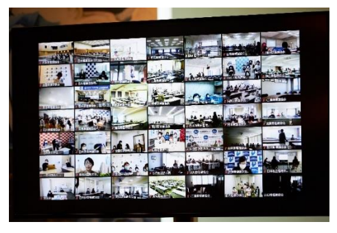
Nursing organizations promoting Nursing Now and Prefectural Nursing Associations organized group viewing