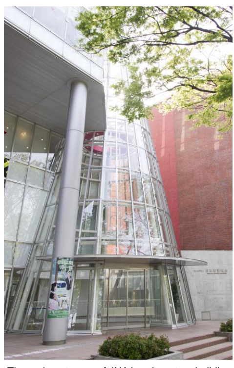
The main entrance of JNA headquarters building

Most lectures are accompanied by a tour of the JNA headquarters building. The headquarters building, impressive with the glass cone as shown in the right picture, is located in Omotesando, Tokyo, one of the country's centers of commerce and fashion culture. Construction of the building itself was completed in 2004. The JNA Plaza is located on the third floor of the building and serves as a space for providing information and displaying exhibits about nursing. The JNA Plaza is accessible to general visitors as well.