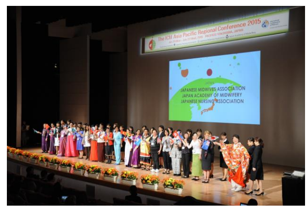
Flag ceremony at the 11th ICM Asia Pacific Regional Conference

JNA co-hosted the 11th ICM Asia Pacific Regional Conference (ICM-APRC) in Yokohama, Japan, from July 20th to 22nd of 2015, with the Japanese Midwives Association and the Japan Academy of Midwifery. The conference theme was "Midwifery Care for Every Mother and Their Newborn." This ICM-APRC was attended by approximately 3,200 midwives and midwifery students from 37 countries and regions mainly in Asia and the Pacific and was featured with 212 oral and 440 poster presentations.